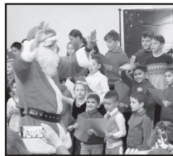
Santa at the Christmas Program