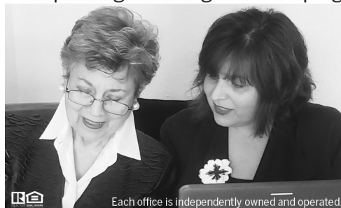
Each office is independently owned and operated.

Surpassing clients' goals & helping realize their dreams for over 35 years!