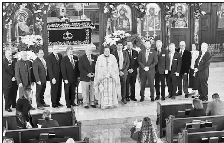
New board members to the Parish Council taking their oath in church