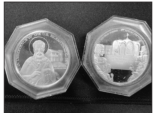
Medal of St. Photios