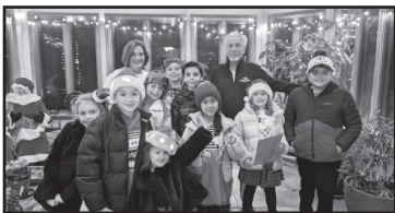
Our group singing Christmas Carols.