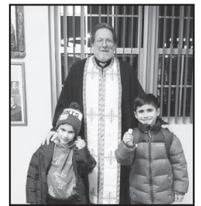
Our lucky coin winners!