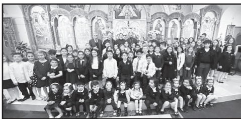
Three Hierarchs Program in Holmdel.