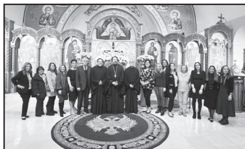
Three Hierarchs Program in Holmdel